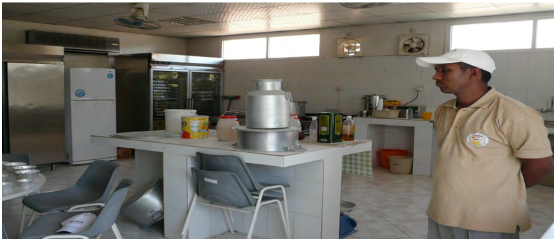
Saluki Centre Kitchen