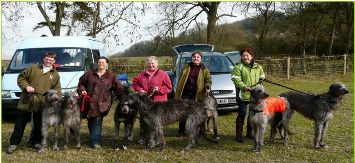
Coursing the Deerhounds