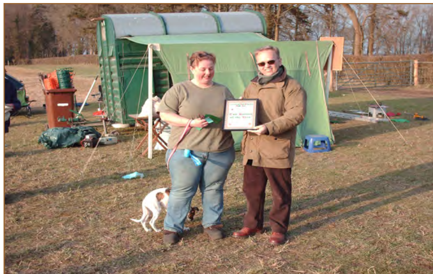
Hound of the day with QLCA certificate