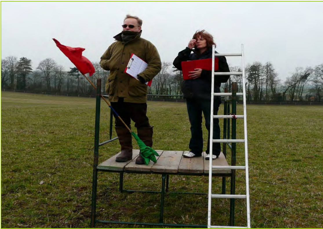
Getting ready to judge